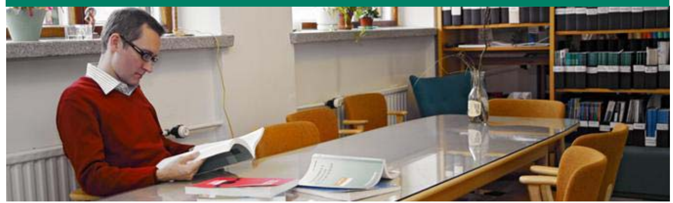
Subjects: International Business Communication, Spanish, Italian, Japanese, International Business Communication, French, Swedish, German, Finnish Language and Communication, Russian

2 professors, 26 lecturers, 101 students (majoring), 18 755 credits achieved, 5 MSc graduates