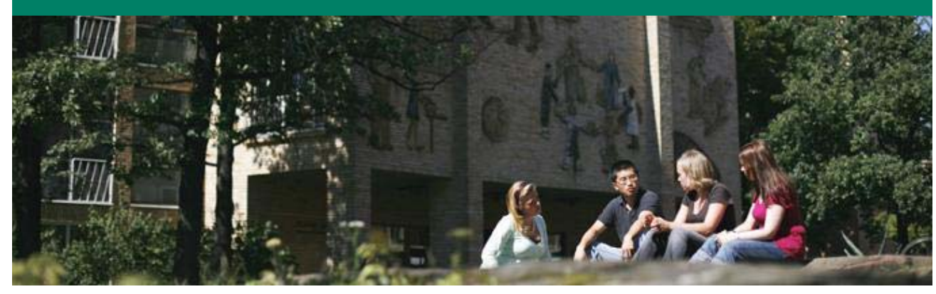
HSE First in Nordics to Receive the Triple Crown

In 2007 HSE became the first Nordic business school to receive the international AACSB accreditation.