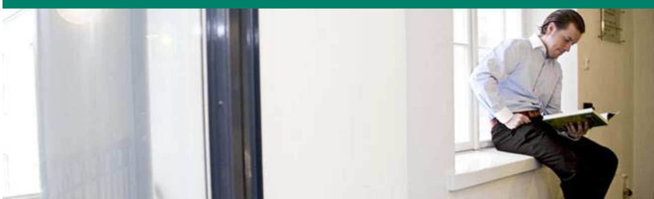
Subjects: International Business, Marketing, Organization and Management, Economic Geography, Entrepreneurship, and SME Business Management

18 professors, 7 lecturers, 1 167 students, 37 127 credits achieved, 135 MSc graduates 1 licentiate degree, 11 doctoral degrees