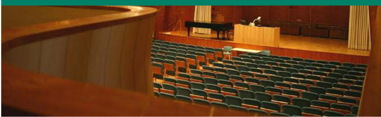
Support, Recognition, and Donations to Economic Sciences

"HSE Foundation – 33 years of support for teaching and research in economic sciences"