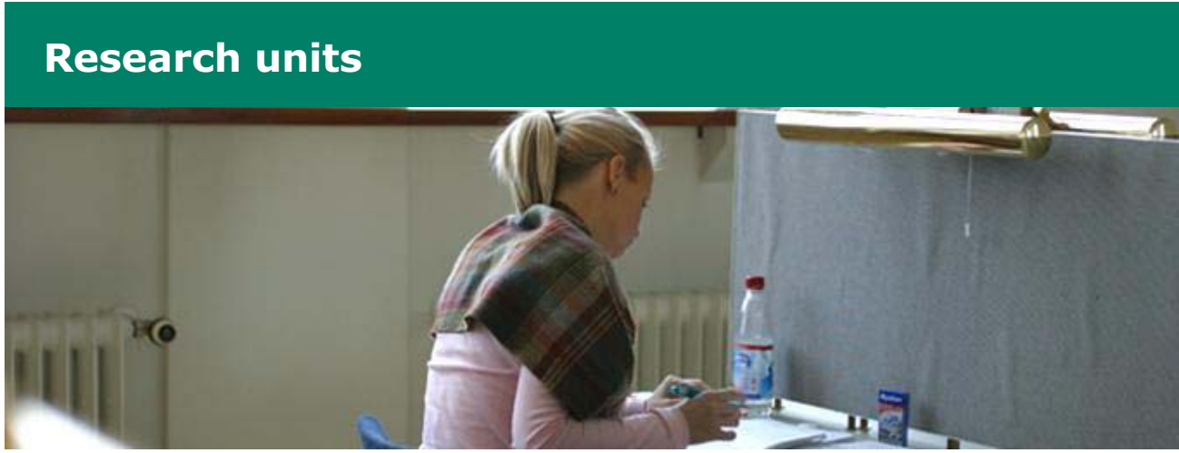
Center for Markets in Transition, CEMAT

Center for Markets in Transition (CEMAT) is a research unit whose entire operational idea is based on combining academic expertise and social relevance. CEMAT focuses on the basic and applied research in rapidly developing market areas such as Russia, the Baltic Sea area, Asia, and Latin America.